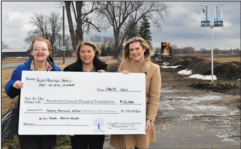
On-site at the Stratford "Poet & Perth" Townhome community - coming soon...

Thank you to Reid's Heritage Homes who have made an incredibly generous investment of $20,000 in Youth Mental Health services! Our hospital is aimed at working with our community partners across Huron and Perth Counties to strengthen the elements we know have the most impact on the mental health of youth and young adults. Our goal is to provide a seamless response across age barriers and partners by working together, improving navigation and utilizing technology. This transformation is part of our "In Our Hands" Campaign---mental health...is in our hands. We are working on raising $1 million to improve local mental health both in our inpatient unit and throughout our communities.